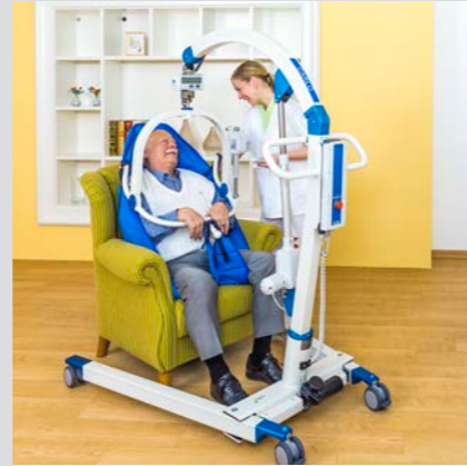
Electrical spreadable chassis and height adjustment