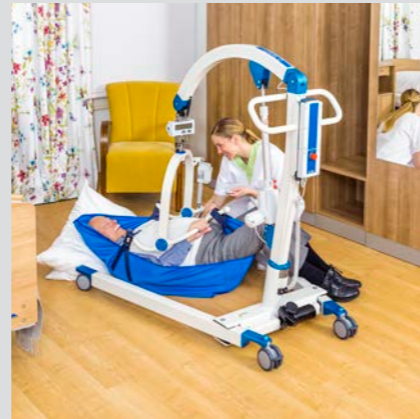
Lowering of the hanger bar to the floor