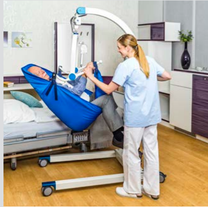
Anti-rotation mechanism (ARM)