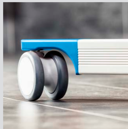
High quality closed double castors