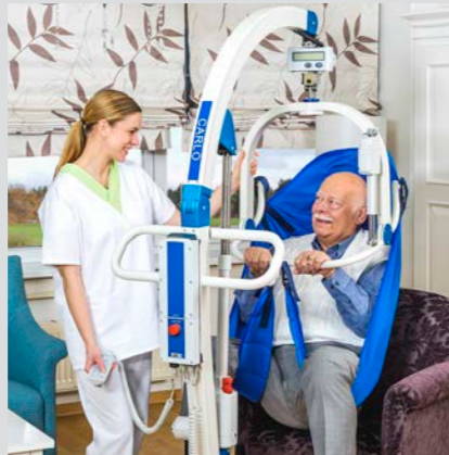
Free 360° rotation range between the hanger bar and the column