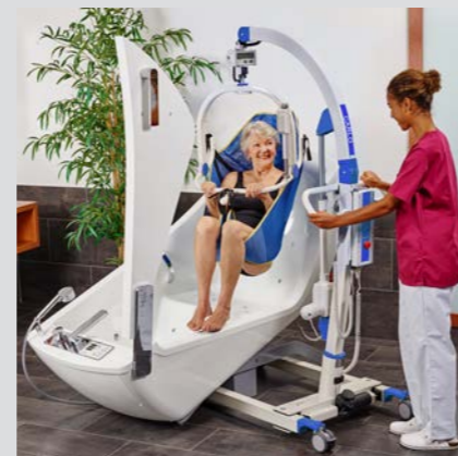
Ideal for bathing and showering