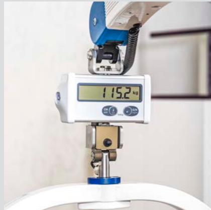
Optional: digital scale